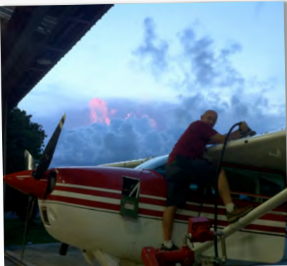
FUELING FOR AN EARLY FLIGHT