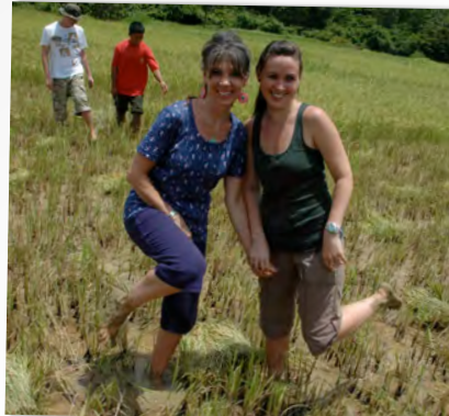
HARVESTING RICE IN A TRIBE