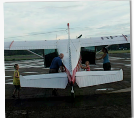
PUSHING THE PLANE OUT